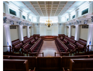
Chamber † $2,000 / 4hrs