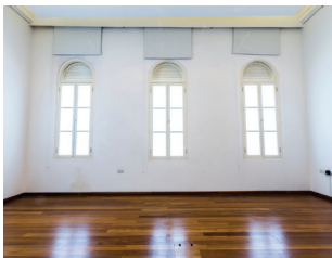
Council Room $100 / hr