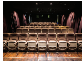
Screening Room $800 / 4hrs $150 / 2hrs (Film screenings only)

† Note: F&B is not allowed at this venue