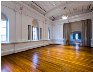
Blue Room $600 / 4hrs $300 / day †

Setup/teardown/rehearsal rates thereafter at 60% of published rate.