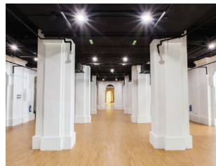
Gallery I $675 / 4hrs $450 / day ‡