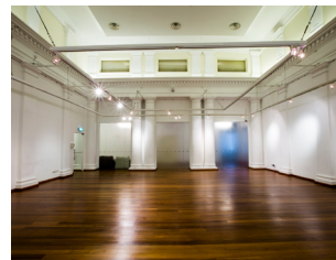
Gallery II $570 / 4hrs $300 / day ‡