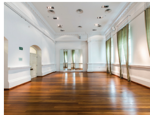
Living Room $450 / 4hrs $300 / day †